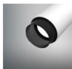
ACSN-10 Long snoot