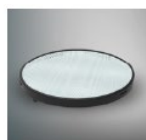
ACWG-8 Woven glass