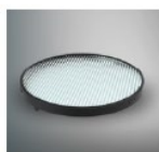
ACSG-7 striped glass