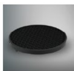
ACHO-10 Honeycomb louver